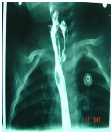
Pre Op. Barium Swallow