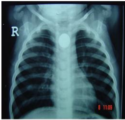
Pre op. chest X-ray

Case 1- A 9-month old boy with a 5 day cough and cyanosis showed a chest x-ray foreign body (5mm) disc battery in proximal esophagus. The battery was removed by laryngoscopy. The patient continued to suffer from cough, dyspnea, and cyanosis. The physical examination revealed bilateral coarse crackles. Barium swallow showed a TEF in the upper esophagus. The fistula was repaired successfully and no evidence of TEF was found in the follow-up barium swallow.