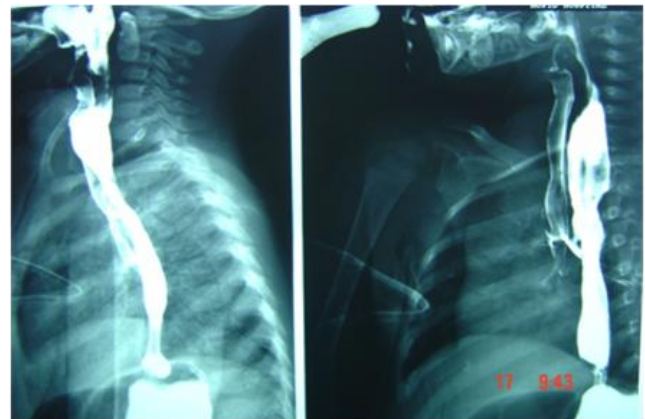
Pre-Op Barium swallow with TEF

Case 2- A 2.5-year old boy was admitted with a history of vomiting after ingestion of solid food and productive coughs for eight months. Barium swallow suggested a foreign body and chest x-ray showed a density in the lower esophagus. CT-scan showed a foreign body in the lower esophagus with possible penetration into the right bronchus. The foreign body was removed during esophagoscopy. A thoracotomy with TEF repair was performed. No fistula was found in the post-operation follow-up barium swallow.