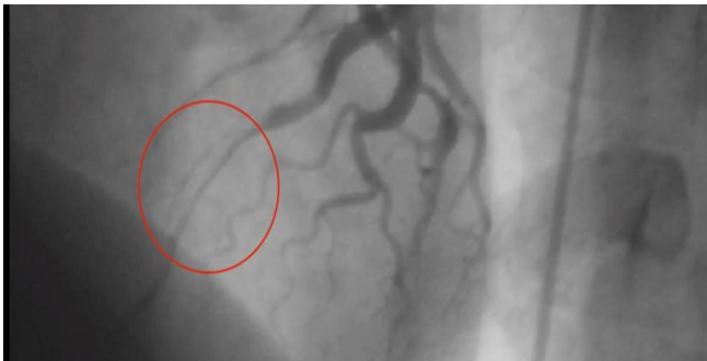
Figure 1. Muscle-bridge in LAD

His past medical history was as follows; in 2003 he had TCP and underwent coronary angiogram (CAG) in Hamedan due to positive non-invasive tests. ECG at that time was unremarkable. Muscle-bridge in LAD was diagnosed ( video 1 and figure 1). In 2007, he became symptomatic despite full-dose medical treatment (propranolol and diltiazem at maximum tolerable doses) and non-invasive testing (myocardial perfusion imaging [MPI]) was also positive. Hence another CAG was done at THC, and percutaneous coronary intervention (PCI) with stenting was performed, Taxus 2.75-32 @ 18 atm was implanted ( video 2 ). Micro perforation happened during stent deployment, ( video 3 ) a balloon was inflated at site for 10 minutes to stop the leakage. Overlap stenting was also done for another stenosis using Taxus 3-16 @ 16 atm. The patient was symptom free for about a year, however in 2008, he became symptomatic and his local interventionist in Hamedan Hospital decided to perform another CAG ( video 4 ).