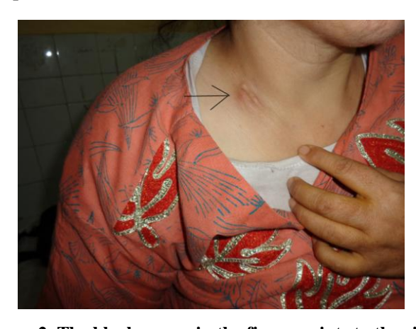
Figure 2. The black arrow in the figure points to the right supraclavicular lymph nodes enlarged due to metastatic spread.