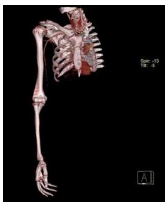
Figure 1: Reconstructed CT angiography show right brachial artery occlusion without distal runoff.

He was cautious and the vital signs were in the normal range (blood pressure: 120/80 mmHg, heart rate: 80 per minute, respiratory rate: 16 per minute and axillary temperature: 37.2 C). There was no history of any comorbidities and traumatic events. Physical examination revealed both radial and ulnar artery pulses were weaker on the right side. He was admitted with primary diagnosis of cerebrovascular events. Brain computed tomography (CT) scan was done and there was not any evidence of cerebrovascular pathologies. Cardiac monitoring showed normal sinus rhythm. After 4 hours, the right hand became numb and significantly colder than the left one. Also, the radial, ulnar and brachial pulses were not detected. CT angiography was requested which showed right brachial artery occlusion without any distal blood flow runoff (figure 1).