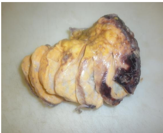
Figure 1: Macroscopic appearance of left ovarian fibroma / thecoma.

Due to clinical suspicion of malignant ovarian tumor, the patient was submitted to exploratory laparotomy. During surgery, the abdomen was opened with a midline incision. Separated collections of straw-colored fluid were between bowel loops and pelvis which were evacuated. A 100×120 cm mass with yellow color was seen in her left adnexa which was attached loosely to bowel, colon and bottom of pelvis and was removed gently sent with ascitic fluid to pathology department (figure 1).