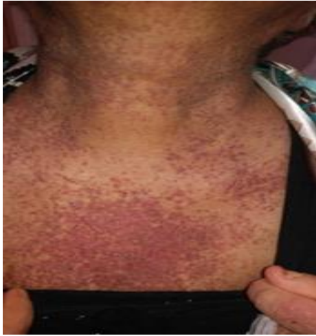
Figure 1. Keratotic papules over body, marker of Darier disease

Initial laboratory evaluations revealed high serum titers of creatinine phosphokinase (5180 IU/L), Lactate dehydrogenase (2099 IU/L) SGOT (281 IU/L), SGPT (162 IU/L), ESR (42mm/hr), aldolase (72 IU/L) levels. Antinuclear and antisynthetase, (JO-1, Mi-2) antibodies, were negative, but ,antibodies against signal recognition particle (SRP) and NXP2 (MJ-p 140-MU 140 kD protein) were positive. Electrodiagnostic investigation showed a myopathic process more prominent in proximal muscles without spontaneous activity. Serum markers and radiologic workups for occult malignancies were normal. In magnetic resonance imaging (MRI) of limbs, extensive and diffuse signal alteration (low on T1, high on T2) with feathery appearance accompanied by a little fluid accumulation between muscle fibers and intervening fascia of pelvic and shoulder girdle were seen (figure 2).