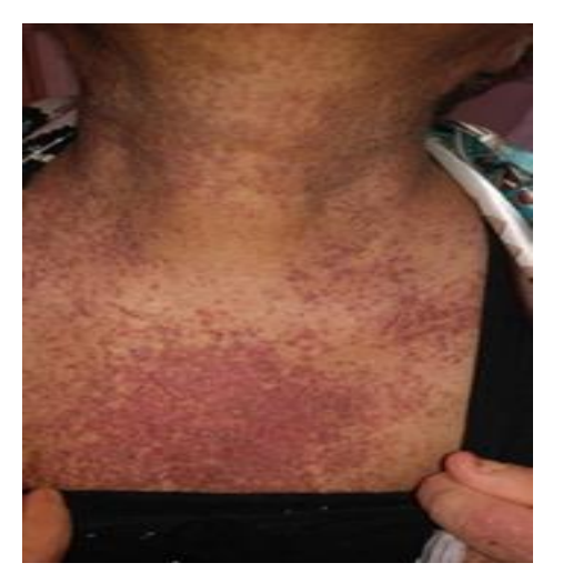
Figure 1. Keratotic papules over body, marker of Darier disease

Initial laboratory evaluations revealed high serum titers of creatinine phosphokinase (5180 IU/L)), Lactate dehydrogenase (2099 IU/L) SGOT (281 IU/L), SGPT (162 IU/L), ESR (42mm/hr), aldolase (72 IU/L) levels. Antinuclear and antisynthetase, (JO-1, Mi-2) antibodies, were negative, but antibodies against signal recognition particle (SRP) and NXP2 (MJ-p 140-MU 140 kD protein) were positive. Electrodiagnostic investigation showed a myopathic process more prominent in proximal muscles without spontaneous activity. Serum markers and radiologic workups for occult malignancies were normal. In magnetic resonance imaging (MRI) of limbs, extensive and diffuse signal alteration (low on T1, high on T2) with feathery appearance accompanied by a little fluid accumulation between muscle fibers and intervening fascia of pelvic and shoulder girdle were seen (figure 2).