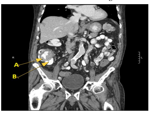
Figure 2. Coronal view, CT scan abdomen with contrast: Arrow 'A' pointing at malignant mass, which appears to encircle colonic wall to give an apple-core like lesion picture. Arrow 'B' is pointing at cecum.

Figure 1. Axial view, CT scan abdomen with contrast: Solid arrow pointing at cecum. Solid lines pointing at contrast enhanced malignant mass. The mass is seen to be encircling more than 80 % of the circumference of the gut wall.