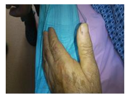
Figure 1: Splinter hemorrhages of the patient with infective endocarditis

On admission, the patient had a fever of 39.5^{\circ} C, blood pressure of 100/50 mmHg and heart rate of 100/min. Pulmonary sounds were rough and there was no crepitation. A 2/6 pansystolic murmur was audible at all cardiac foci. There was mild edema in both legs. There were splinter hemorrhages in the nails (figure 1).