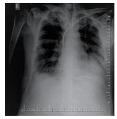
Figure 2: Implantable cardioverter defibrillator, increased cardiothoracic ratio, bilateral pleural effusions, and dual chamber pacemaker on chest x-ray.

An electrocardiogram showed pacemaker rhythms. A bigeminy ventricular extrasystole was noted. A chest x-ray revealed a bilateral reticulonodular pattern. There were bilateral pleural effusions. The cardiothoracic index was increased. The pacemaker generator implanted in the left pectoral region was present along with two (atrial and ventricular) leads, which appeared to extend into the heart (figure 2).