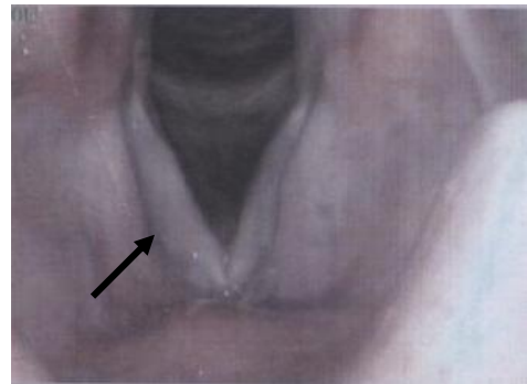
Figure 3. Vocal cord of the patient after treatment

A standard six month treatment with a combination of isoniazid, rifampicin, pyrazinamide, and ethambutol was started for two months followed by isoniazid and rifampicin for additional four months. The follow up after treatment showed resolution of the symptoms and improvement of the mass (figure 3).