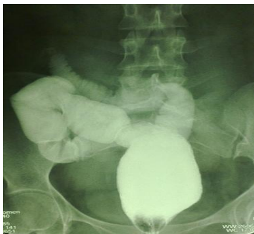
Figure3. Barium enema study in a patient with ulcerative colitis 10 years after primary surgery.

The main postoperative complications included recurrent enterocolitis in 2 cases with hirschsprung disease that responded to conservative management including bowel rest and cotrimoxazole and metronidazol therapy and rectal enema with normal saline. We had 2 cases of perianal fistula, one in a patient with ulcerative colitis and another in hirschsprung patient. Both of them led to fistulotomy and Seton insertion. Only 2 patients still are suffering from some degree of fecal soiling. There were 5 cases of adhesive bowel obstruction; one of them required an enterolysis in hirschsprung disease. Minor wound infections occurred in 2 patients. There were no anastomotic leaks, no cases of pouchitis encountered.