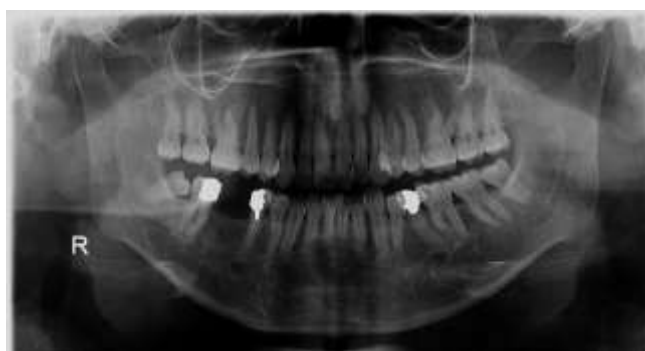
Figure 3. Panoramic radiography showing obliteration of maxillary sinus in thalassemia major