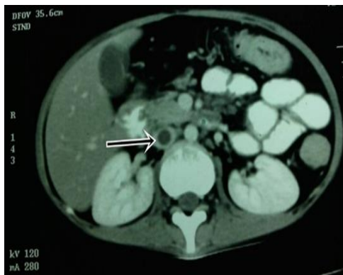
Figure 1. CT abdomen showing thrombus in IVC

Her routine investigations revealed a hemoglobin level of 8.9 g/dl, total leucocyte count (TLC) of 10,500/mm 3 , erythrocyte sedimentation rate (ESR) of 6 mm. in 1 st hour, low albumin level (2.5g/dl) and serum creatinine of 0.9 mg/dl. Stool examination revealed presence of mucous, blood and pus cells. Chest x-ray, ultrasonography of whole abdomen was unremarkable. She was found to be HIV negative. Duplex color doppler of both lower limbs revealed presence of intraluminal thrombus involving the inferior vena cava (IVC) from the level just beyond the origin of left renal vein up to the popliteal vein. Contrast enhanced CT (computed tomography) of abdomen was done which confirmed the presence of IVC (inferior vena cava) thrombosis (figure 1).