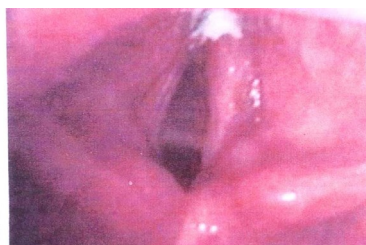
Fig 1. Stereoboscopy of right vocal cord lesion

A 51- year -old man was admitted to the hospital due to a progressive hoarseness with mild odynophagia that started two years ago. In indirect laryngoscopy-stroboscopy, a white lesion with undefined margin was seen in the right anterior commissure of the larynx (Figure 1). The chest x-ray was normal and so was the blood chemistry, but the PPD test was positive. The patient was not a drinker or a smoker. The oral cavity, and pharynx was normal, The esophagoscopy done was also normal. There were not any lesions throughout the body and the skin was intact. Using the general anesthesia, direct laryngoscopy was performed and so was the biopsy of the lesion. The pathologic examination of the lesion was reported to be lichen planus of the right vocal cord involvement (Figure 2).