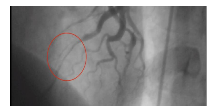
Figure 1. Muscle-bridge in LAD

His past medical history was as follows; in 2003 he had TCP and underwent coronary angiogram (CAG) in Hamedan due to positive non-invasive tests. ECG at that time was unremarkable. Muscle-bridge in LAD was diagnosed (video 1 and figure 1). In 2007, he became symptomatic despite full-dose medical treatment (propranolol and diltiazem at maximum tolerable doses) and non-invasive testing (myocardial perfusion imaging [MPI]) was also positive. Hence another CAG was done at THC, and percutaneous coronary intervention (PCI) with stenting was performed, Taxus 2.75-32 @ 18 atm was implanted (video 2). Micro perforation happened during stent deployment, (video 3) a balloon was inflated at site for 10 minutes to stop the leakage. Overlap stenting was also done for another stenosis using Taxus 3-16 @ 16 atm. The patient was symptom free for about a year, however in 2008, he became symptomatic and his local interventionist in Hamedan Hospital decided to perform another CAG (video 4).