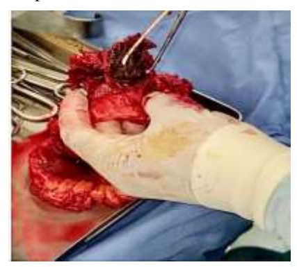
Figure 1. Evidence of the mesh completely intraluminal.

Over the years, the patient has had no symptoms and signs of bowel obstruction and has only complained of chronic intermittent abdominal pain. On physical examination, there was only one bulging on the McBurney incision. All lab tests were unremarkable. CT scan of the abdomen and pelvis confirmed incisional hernia. The patient was nominated for surgery and underwent laparotomy after general anesthesia. After enterolysis and intestinal adhesions removal, a small bowel loop that adhered to McBurney's region was released. There was a mass inside the small intestine. In the surrounding area, there was no sign of an abscess, fistula, or sinus formation. Resection and anastomosis of the involved intestine were performed. After enterotomy, it was determined that this mass was the mesh used in the previous surgery (fig. 1). The patient was discharged from the hospital 5 days after surgery, in good general condition and without any particular problems.